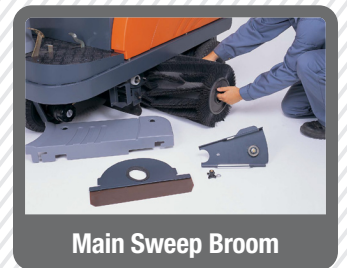
Main Sweep Broom