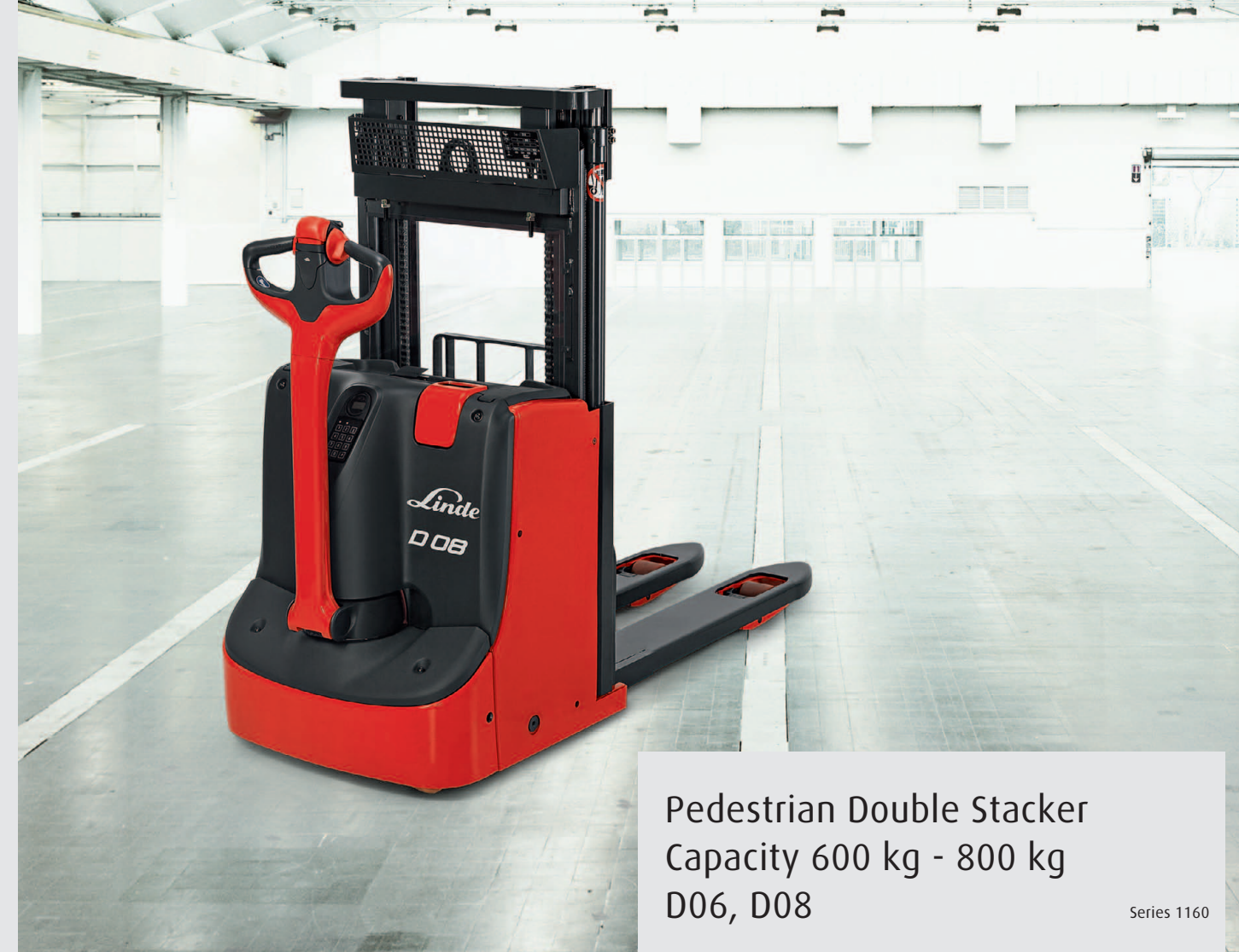
Pedestrian Double Stacker Capacity 600 kg - 800 kg D06, D08